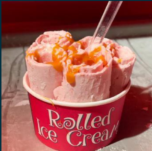
ICE CREAM BARS

Speak to our sales team for a dedicated personalise quotation at sales@excelhospitality.london