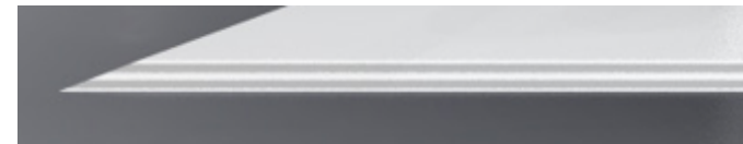
Example of fluent floor difference